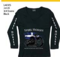
LADIES Jenny B 3/4 Sleeve Black