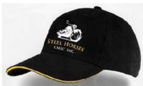
Steel Horses Caps $17.00