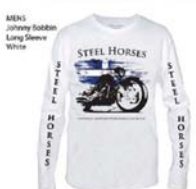
MEN'S Johnny Bottom Long Sleeve White