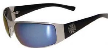
Chopper sunglasses $15