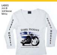
LADIES Jenny B 3/4 Sleeve White