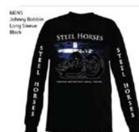
MEN'S Johnny Bottom Long Sleeve Black