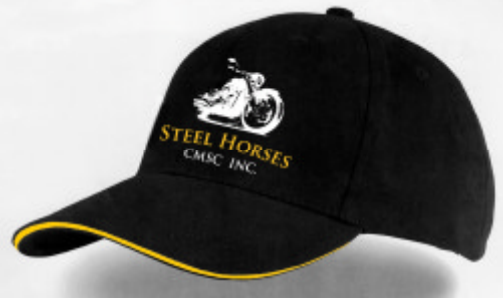
Steel Horses Caps $17.00