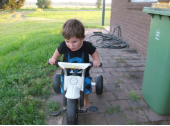
A new club member I think he's riding a VTX Honda!

The weather was overcast so I put on my leather jacket expecting rain but what a mistake that was. On the way to Goodna the sun came out and I cooked inside the jacket all day.