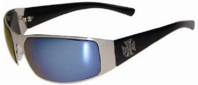
Chopper sunglasses $15