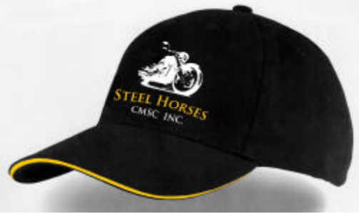
Steel Horses Caps $17.00