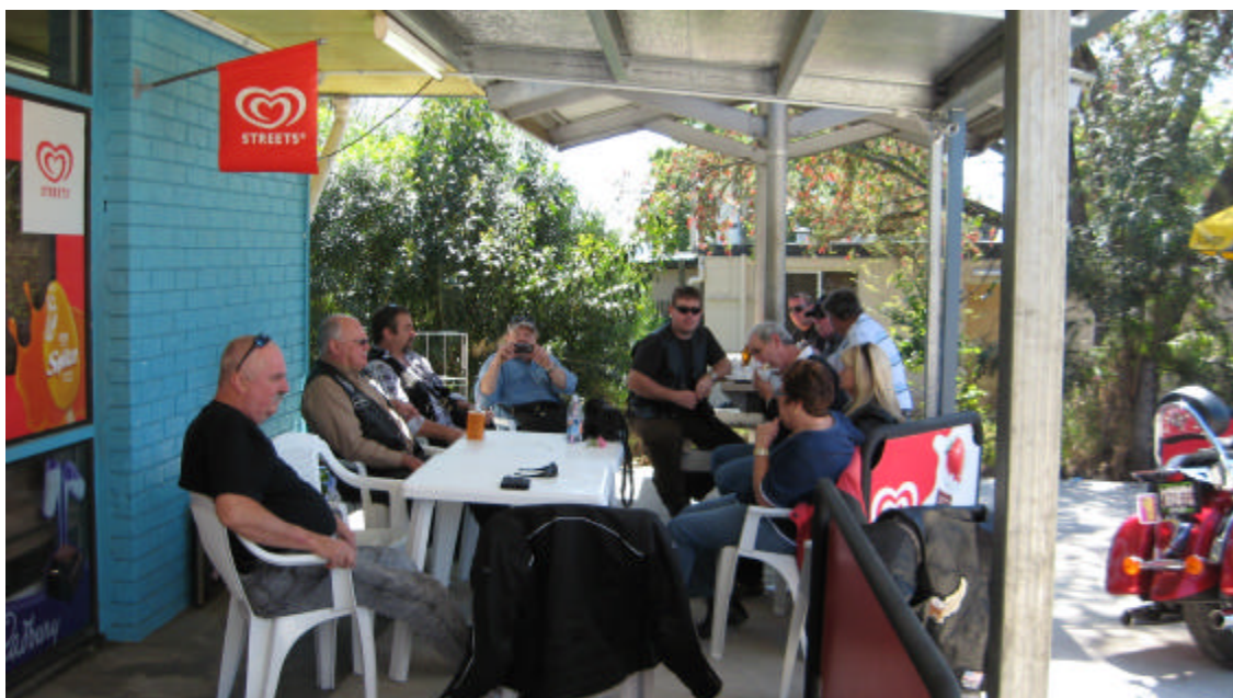
Where we ate on the 1 st club ride

GO IN PEACE. YOU HAVE JUST BEEN SCREWED BY THE SISTERS OF ST. FRANCIS. SERVES YOU RIGHT, YOU SINNER