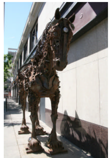
Two views of a STEEL HORSE that Jenny photographed in Calgary, Canada in 2008